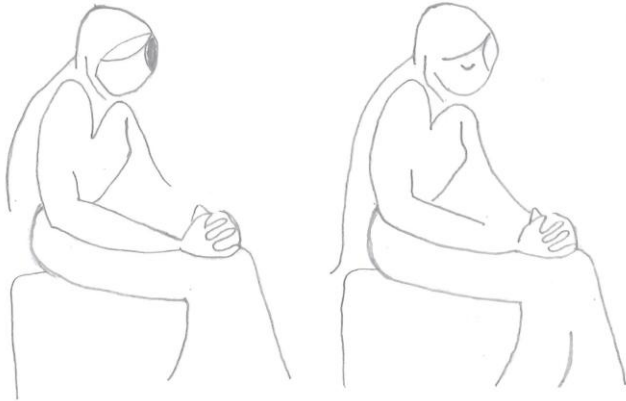
Mary remembered all those things Luke (2.19)

Can you find these 6 differences? Good luck